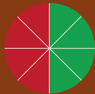
Half'n'Half 13"-8 slices